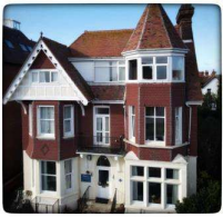
Volume 2 Issue 7