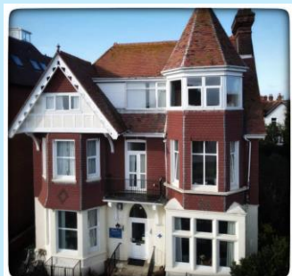
Volume 2 Issue 11